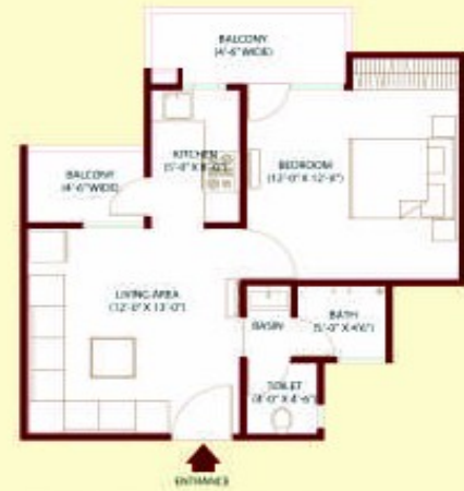
1BHK Super Area - 730 Sq. Ft.