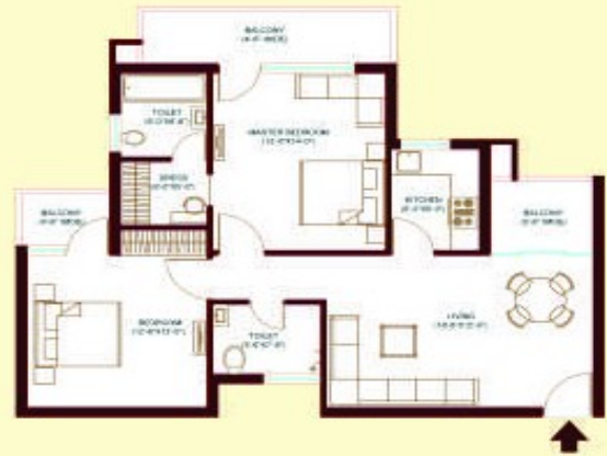
2BHK Super Area - 1270 Sq. Ft.